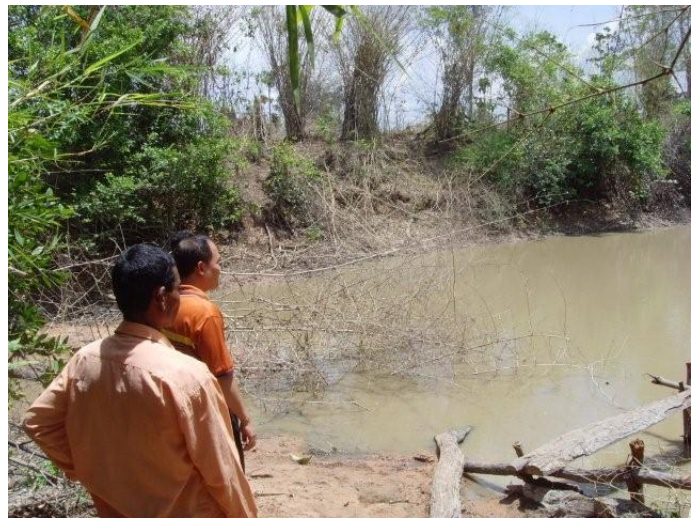
Paragon CADG Agro (Singapore)