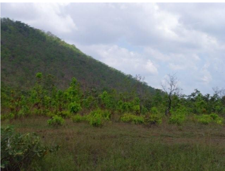
Paragon CADG Agro (Singapore)